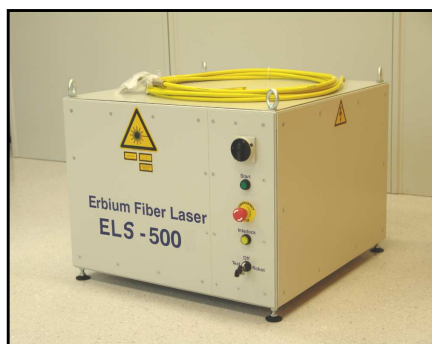
Figure 1: 500 W Erbium fiber laser system ELS-500, emitting at \lambda=1567\text{nm}

To achieve these demands, IPG Laser GmbH developed a new laser source called ELS-500. This source combines several single mode Erbium fiber lasers and feeds their outputs into a single 200 µm diameter multimode fiber.